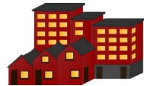
Multi Unit Developments

Additional incentives available for businesses located in Disadvantaged Communities